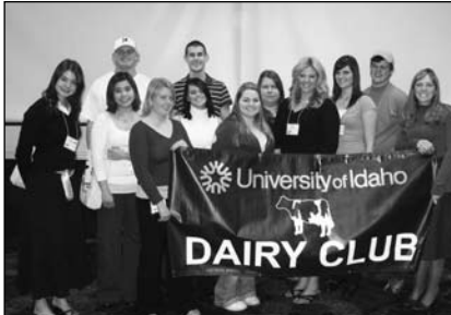
University of Idaho Dairy Club participated in the 2007 Western Dairy Herd Conference

Dairy Herd/Special Activities: 110 Milk Cows; field studies, student dairy club, dairy management challenge team, short and long-term farm & industry internships, working in a laboratory setting, assisting with research.